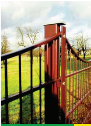
Festening type "I"

Panel fence on the base of VALLEY type welded mats. It consists of FORTE system. A VALLEY type fence consists of welded mats (spans) and posts made of steel cold bent closed sections. The posts are set every 2480 mm. From the standard version they differ in shape - concave ending of the mat top. The posts can be ended